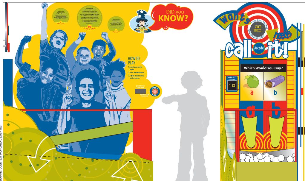
The “Call It! Arcade” exhibit on board the Money Bus.

“NFI has vision,” she said, “and it’s exciting to know that this forward-thinking, innovative project will educate so many young students. Projects like this can sometimes take years to develop. But NFI’s Money Bus was on the fast