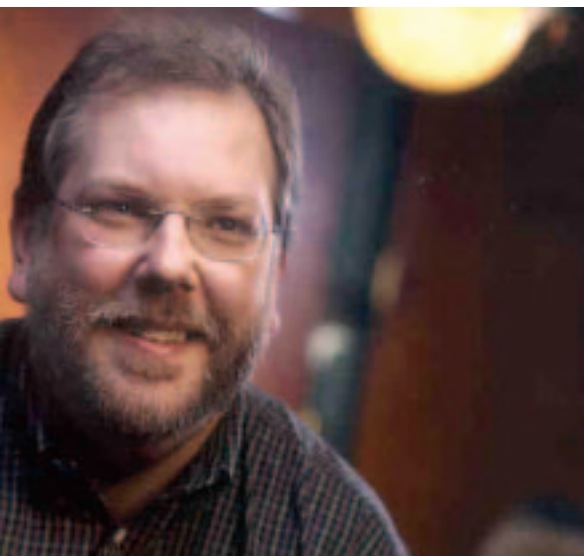
NFI: “I am truly excited. I look forward to helping develop a robust strategic research and engages academia with business to global financial services.”