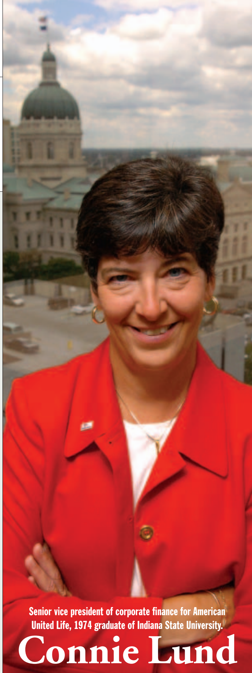
Senior vice president of corporate finance for American United Life, 1974 graduate of Indiana State University.