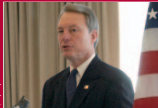
U.S. Rep. Richard Baker, R-La., speaks at NFI's 2004 Regulatory Reform Summit in D.C.

As the event's date draws closer, learn more about opportunities to join discussions in D.C. with policymakers, financial services industry executives and others by visiting NFI online at www.networksfinancialinstitute.org .